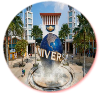
Universal Studios Singapore