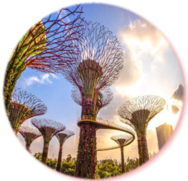
Gardens by the Bay