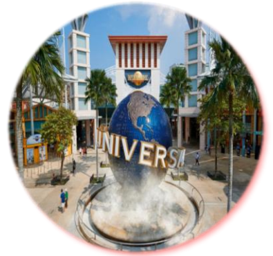
Universal Studios Singapore