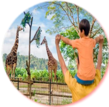
Mandai Wildlife Reserve