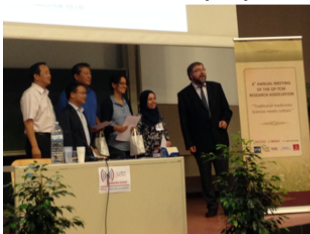
GP-TCM RA Travel Award winners