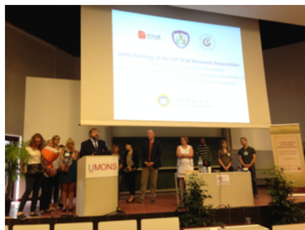
The home-team receiving applause for their excellent work