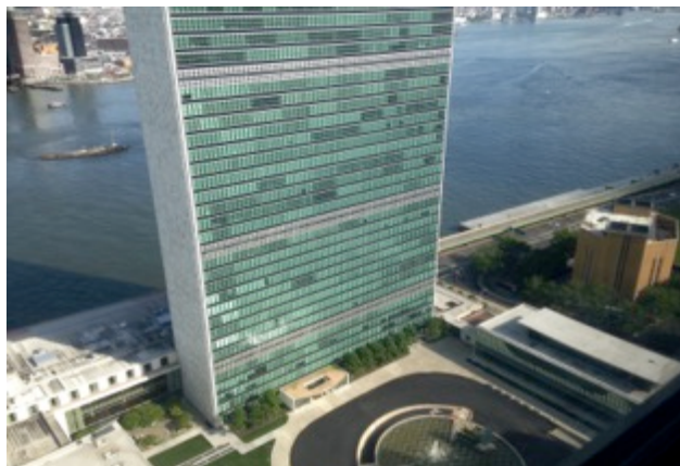
United Nations Headquarters, New York City, USA