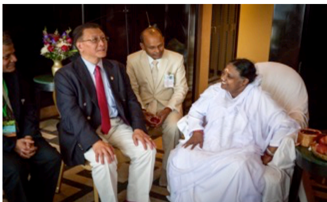
Audience with Spiritual Leader and Humanitarian "Amma" Sri Mata Amritanandamayi, Chancellor of Amrita University, India