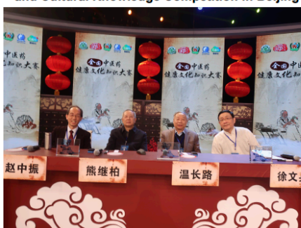
The expert panel is ready to explain answers and for further discussions