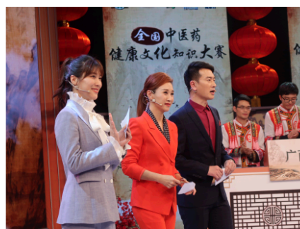
Hosts introducing the next round