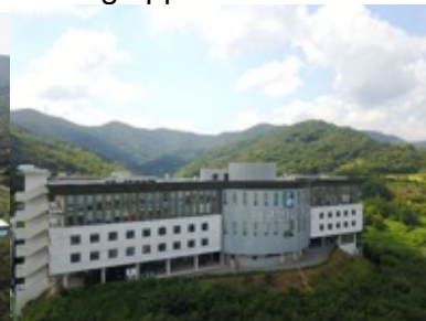
Left: NIKOM; Middle: DHU; Right: Venue at DHU ( https://goo.gl/Maps/9ujccwriyrz )