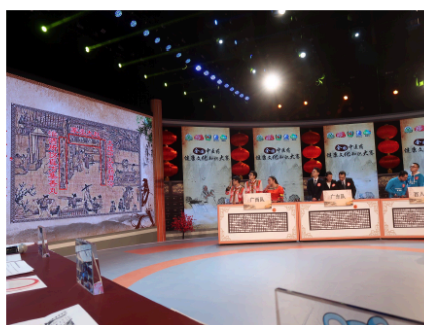
The contestants considering the final question for the national championships.