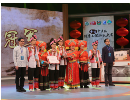
The winning Guangxi team receiving their award