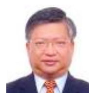
Editorial-in-chief & Deputy Editorial-in-chiefs

3. The 7 th Annual Meeting of GP-TCM RA will be held in Daegu Haany University (DHU), Daegu City, Republic of Korea, on July 9 th – 10 th , 2019. The meeting will be jointly hosted by National Development Institute of Korean Medicine (NIKOM) and DHU. Don't miss this great chance to experience Daegu with an exciting conference programme and the networking opportunities!