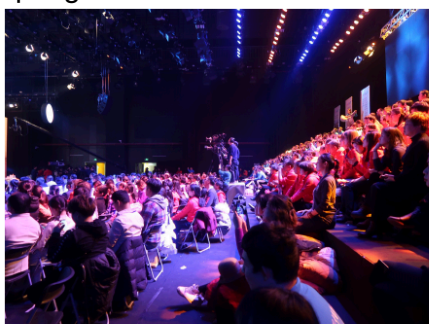
Venue for the finals of the National TCM, Health, and Cultural Knowledge Competition in Beijing

3. The National Traditional Chinese Medicine, Health, and Cultural Knowledge Competition was held on 16 December 2018 – With the theme of Traditional Chinese Medicine in Everyday Life , the finals of the National Traditional Chinese Medicine, Health, and Cultural Knowledge Competition were successfully held in Beijing. The competition was hosted by the Traditional Chinese Medicine Promotion Organization with co-hosts the China Press of Traditional Chinese Medicine, the Chinese Educational Network TV Health Station, the State Administrations of Traditional Chinese Medicine of the various provinces, autonomous regions, and municipalities directly under the Central Government, etc. After five months of fierce competition, 560,000 registered participants, and 60 million viewers, 30 provincially selected teams and a group of 100 nationally selected participants gathered in Beijing for the competition. While all six final teams performed brilliantly, the Guangxi team emerged as the national champions. The final competition will be broadcasted on the Chinese Educational Network TV Health Station and other major online video platforms during the Spring Festival of 2019.