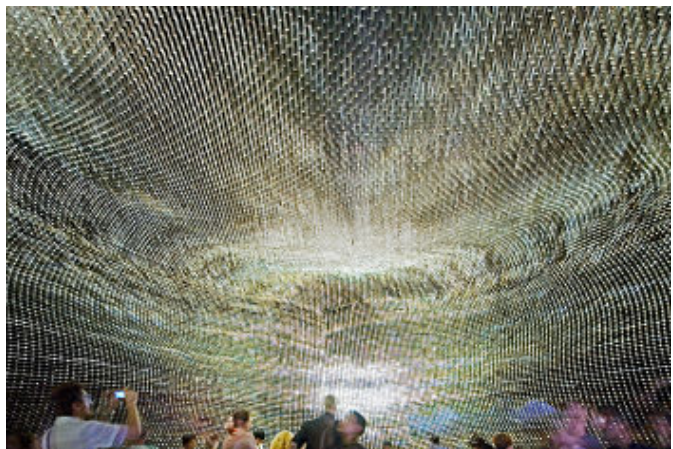
By day, sun illuminated the 25-foot rods, made of fiber-optic filaments; at night, LEDs created a hallowed glow.

texts courtesy of Julie Leibach (Audubon Magazine)