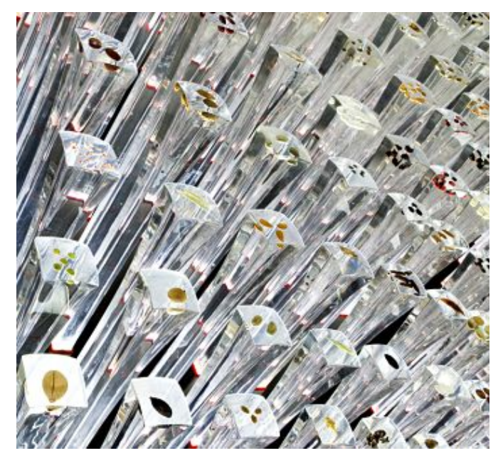
China's Kunming Institute of Botany, a partner in Kew's Millennium Seed Bank Project (MSBP) gave more than a quarter-million seeds to the pavilion. The MSBP's mission: to collect seeds from 25 percent of the world's plant species by 2020.

Inside the cathedral, the rods terminate—or rather, germinate: Those tiny patterns are actually seeds encapsulated in the tip of each rod.